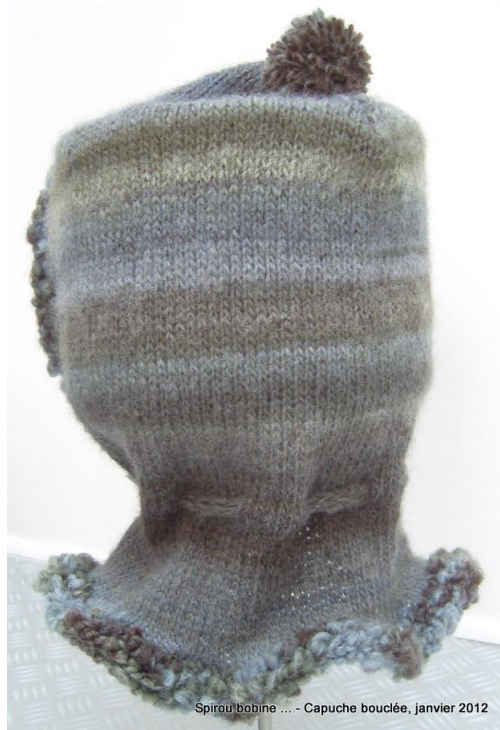
Spirou bobine ... - Capuche bouclée, janvier 2012