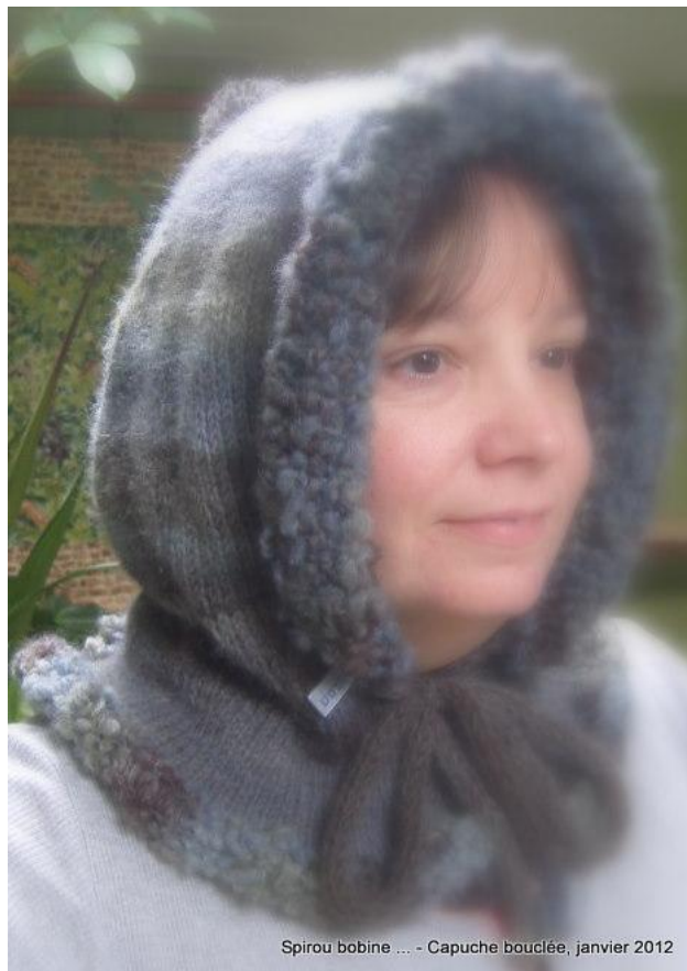
Spirou bobine ... - Capuche bouclée, janvier 2012