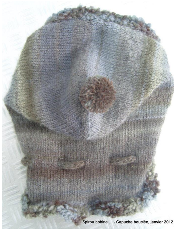
Spirou bobine ... - Capuche bouclée, janvier 2012