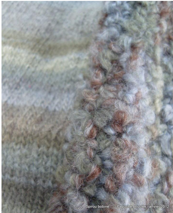
Spirou bobine ... - Capuche bouclée, janvier 2012