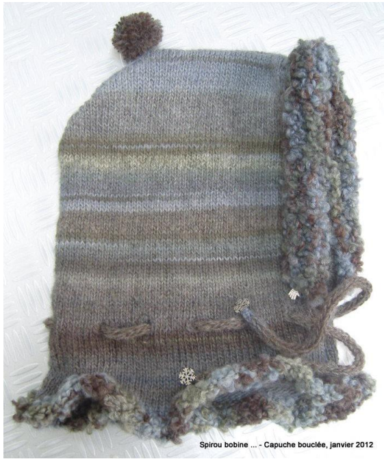
Spirou bobine ... - Capuche bouclée, janvier 2012