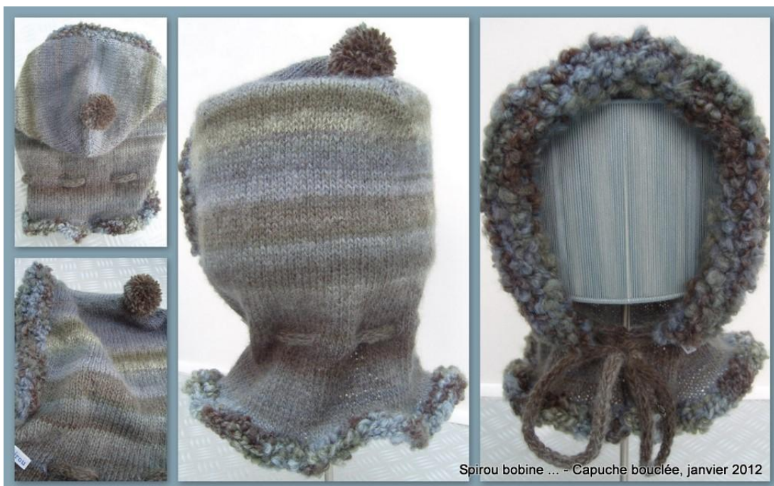
Spirou bobine ... - Capuche bouclée, janvier 2012