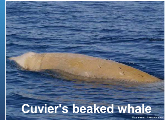
Cuvier's beaked whale