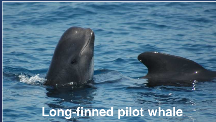
Long-finned pilot whale