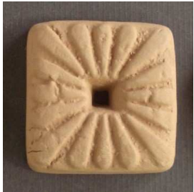
COD. 102 BISCOTTO QUADRATO MISURA: 4X4 cm.