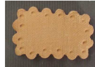
COD. 110 BISCOTTI RETTANGOLARI MISURE: - 4X2.3 cm COD. 110A - 4.5X3 cm COD. 110B - 5.5X4 cm COD. 110C