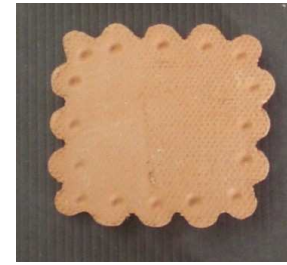
COD.108 BISCOTTI QUADRATI MISURE: -3X3 cm COD.108A -4X4 cm COD. 108B -5X5 cm COD. 108C