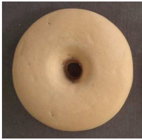
COD. 100 BISCOTTO TONDO LISCIO MISURE: Ø 4.8 cm.