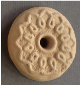
COD. 104 BISCOTTO TONDO DECORATO MISURE : Ø 4.5 cm.