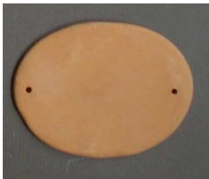
COD. 106 TARGHETTE OVALI MISURA: -3x4 cm COD. 106A - 4.5X5.5 cm COD. 106B - 6X8 cm COD. 106C