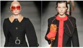
Milan Fashion Week Fall/Winter 2011 coverage