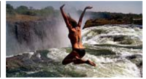
Offbeat Traveler: Devil's Pool at Victoria Falls