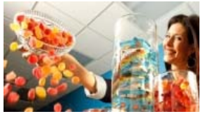
Small businesses face several tax changes