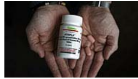
Other routes to HIV drug assistance