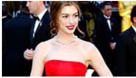
Academy Awards 2011: Red carpet arrivals