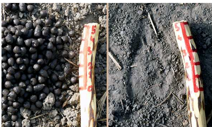
Faeces and footprints of Gazella rufifrons , transects of April

Five gazelles have been observed, but from very very far away... running away at the first sign of human presence. A timid behaviour proving the strong pressure of poaching on this species for generations. Some encouraging results for this first study, which could really help this gazelle in being finally recognized as a threatened species.