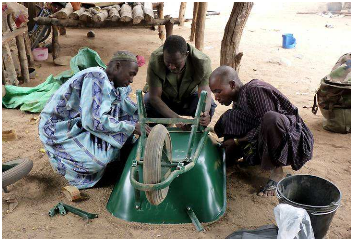
The ecoguards, concentrating on bolting the wheelbarrow together!

In addition, four new eco-guards trained as substitutes have been equipped (bike, phone and clothing). Thus, each area now has five eco-guards to monitor the RNC. It's that which motivate the troops ... and dissuade those uncooperative from "spoiling the bush"!