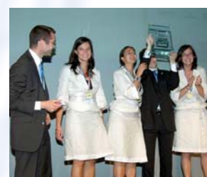
SIFE ESSEC with their National Champion trophy