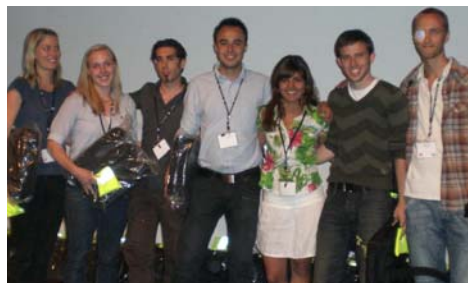
The European Symposium team from Gothenburg