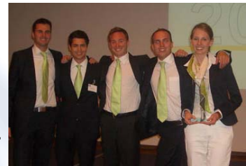
Rookie of the year: SIFE Mannheim