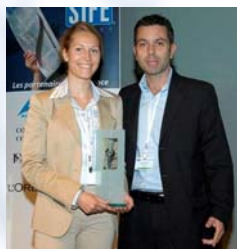
HEC Paris receives L'Oreal Creativity Award