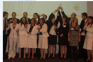
SIFE Magdeburg winning the competition