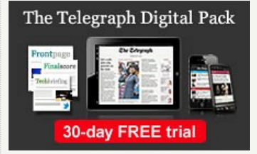
Try The Telegraph for iPad free for 30 days