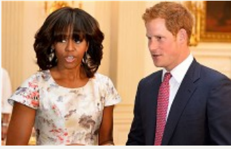
Prince Harry in the US