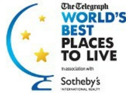
Share with us your favourite place in the world and win £1,000