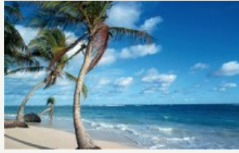
Most competitive travel deals and vacation packages