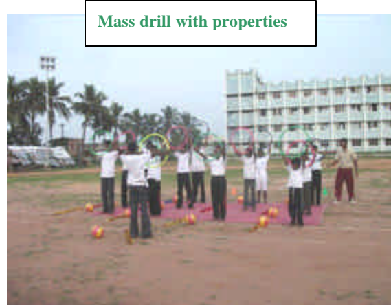
Mass drill with properties