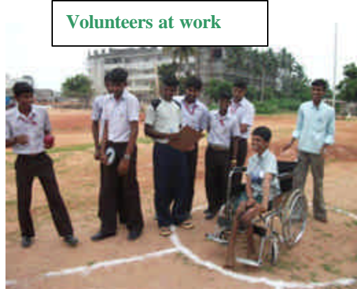
Volunteers at work