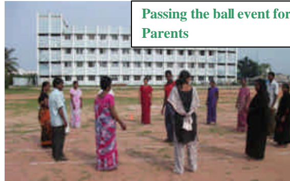
Passing the ball event for Parents

shot put, 50 mts run, 75 mts , 100 mts run , 25 mts walk, 25 mts assisted walk and standing broad jump. In order to encourage and increase the involvement of the parents, two separate events were held for the Mother's. Passing the ball and lucky corner events saw 20 parents eagerly participating in these events. An event – lemon & spoon & 100 mts run was also held for the teachers of the village centers. The sports meet concluded with the Prize distribution Ceremony at 4 pm