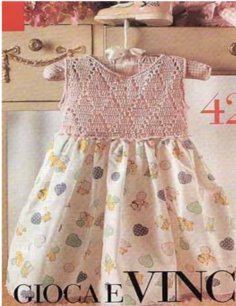
Robe tissu et crochet