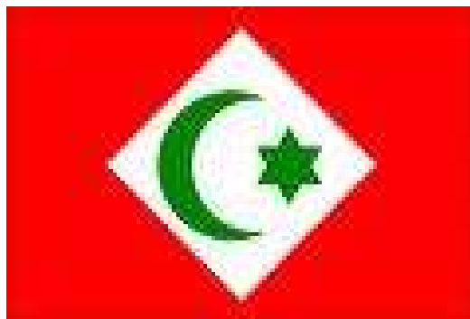
Akbaḥ / Asenḡaq n Tagduda n Arif

Di tejmaât n Arif di Ajdir, anabaḍ i d-ilulen iferru timsal akken yufa, iteddu am win ittṛuḥun asalu, iteddu akken yufa mačči akken ira.