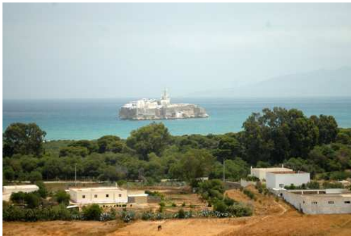
Azru n Nekkuṛ (tigzirt, Penon del Hoceimas)

akked Jafaṛin. Sbanya tesenta tuc̣car-is di tmurt n Tmazya, syen tnebbec yal ass tilisa akken ad tesihrew akal i tuy s yiyil d ubarud. Imenyiyen imeqranen n Irifiyen mgal Sbanya gten, ṭrad ur ikkis yal aseggas. Imeqranen nni llan-d di 1863, 1866, 1871, 1883, 1893 akked 1898. Ass-a di 2011, Mellila d Sebta d tegzirin nniḍen d akal yellan deg ufos n Sbanya, d akal aneggaru n temhersa n Sbanya di Tferka.